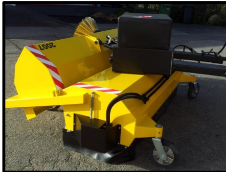
e. g. Special equipment: Front loader mount, Side Broom and Water spraying device