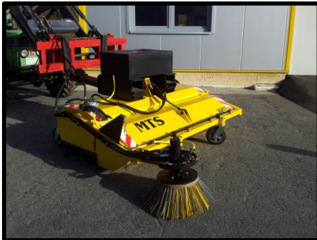
e. g. Special equipment: Front loader mount, Side Broom and Water spraying device