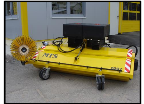
e. g. Special equipment: Double wheels, Side broom and Water spraying device 200l