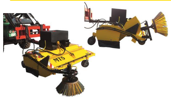
e. g. Special equipment: Front loader mount, Side broom and Water spraying device

Self-collecting and free-sweeping combi-sweeper for specified carrier vehicle with hydraulic connection. The machine is maintenance-free and equipped with fully hydraulic drive. Suitable for efficient and optimal terrain cleaning indoors and outdoors, as well as building, civil and road construction.